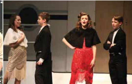
Students at Perrysburg Junior High School dazzled the crowd in December with their spirited revival of Anything Goes, a fast-paced 1930's musical comedy.