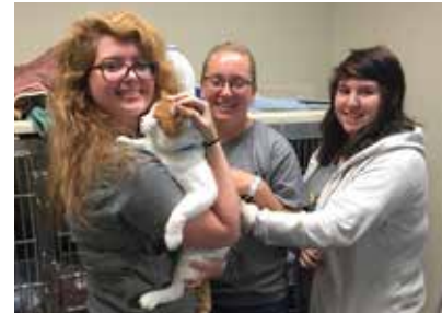
A group of PHS students approached school leaders with the idea of spending a school day serving the community, and “Jackets Giving Back” was born. On October 20, 2017, all PHS seniors had the opportunity to volunteer at various locations throughout the area.