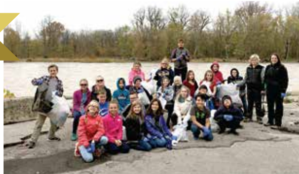
Twenty-five students in the HPI Environmental Club took an after school field trip to Buttonwood Park in Perrysburg to pick up litter – 15 bags were collected.

The Jacket Gymnasts completed their inaugural blanket drive for The Lucas County Children Services Board. The gymnasts made and collected over 40 blankets!