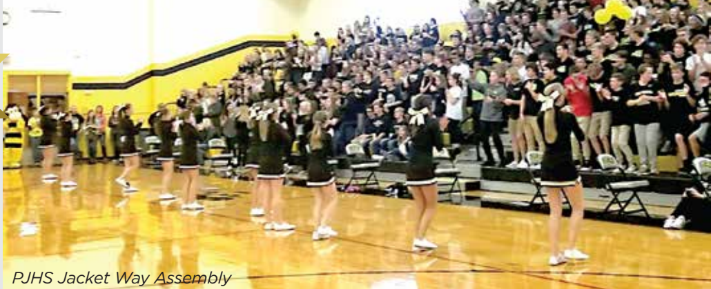
PJHS Jacket Way Assembly

In 2009, a student drug-testing program was implemented for athletes to provide another reason to say no.