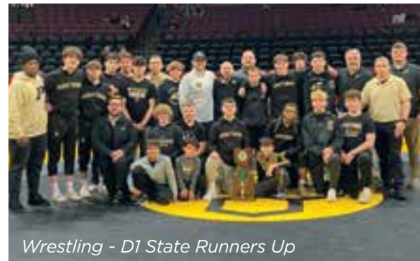
Wrestling - D1 State Runners Up