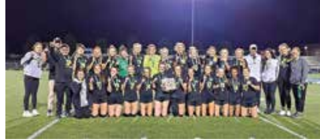
Girls Soccer - District Champions