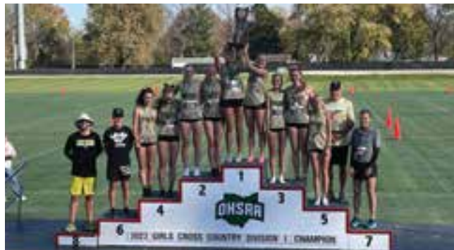
Girls Cross Country - D1 State Champions