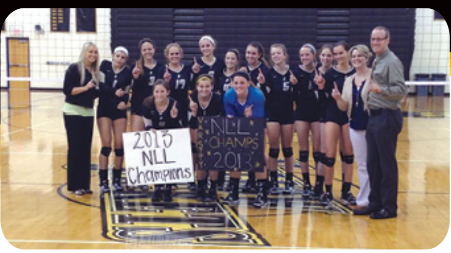
Perrysburg High School Girls' Varsity Volleyball Team