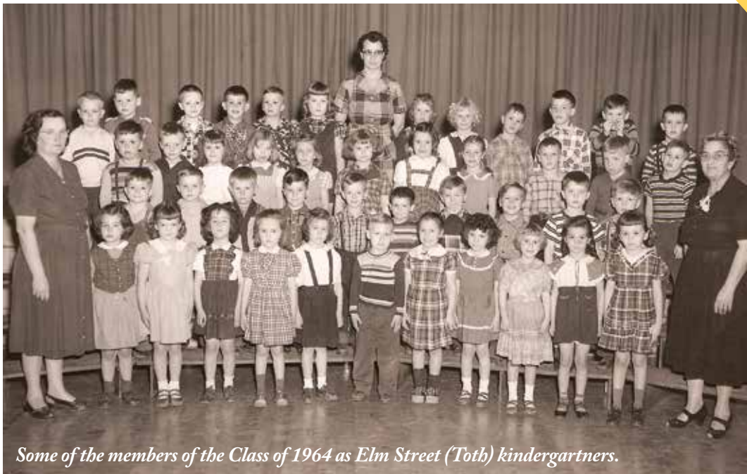
Some of the members of the Class of 1964 as Elm Street (Toth) kindergartners.

But wait. Halfway through their senior year they once again had to move. This time it was to the new high school on East South Boundary (now the Junior High School). While the 148 members of the Class of 1964 actually graduated from the new high school, the 1965 class is given