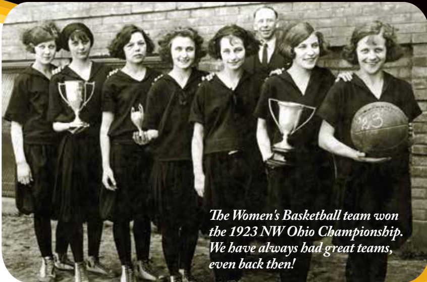
The Women's Basketball team won the 1923 NW Ohio Championship. We have always had great teams, even back then!

NONPROFIT ORG U.S. POSTAGE PAID TOLEDO, OHIO PERMIT NO. 133