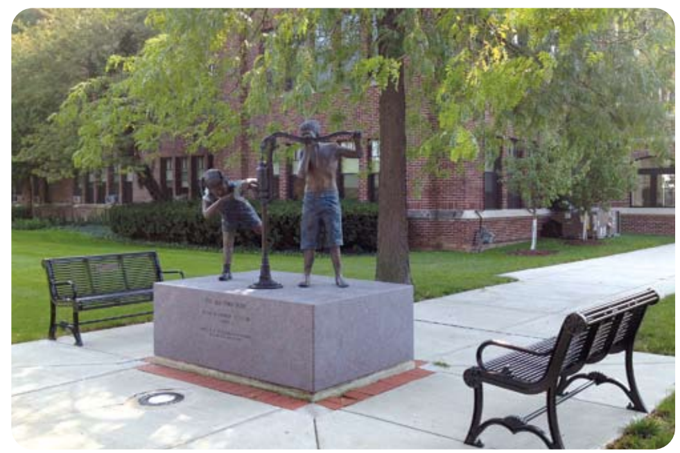
"Old Town Pump" by Ralph Kleeberger ('46 graduate of PHS)